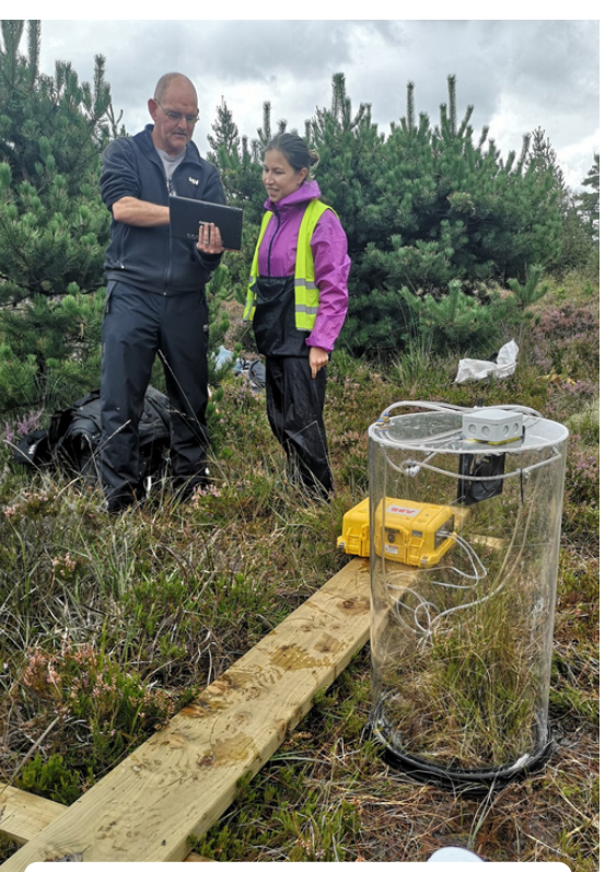
Static chamber measurements at Cloncrow Bog.

Peatlands play a vital role in regulating the global climate by acting as long-term carbon sinks.